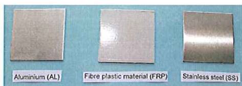
Fig 1. Material surfaces used in the study

Wavelengths at 365, 395, 435, 445, 470 and 490 nm from a monochromator were used to illuminate residues of beef, chicken, apple, mango and skim milk. These were on three surfaces: aluminium, a fibre plastic material (FRP) and stainless steel, pre- and post a cleaning step using commercial detergent. The area covered by residues as detected by specific wavelengths under a fluorescence microscope was compared statistically.