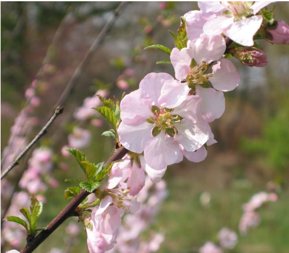
Figure 1: Prunus triloba flowering late april 2003