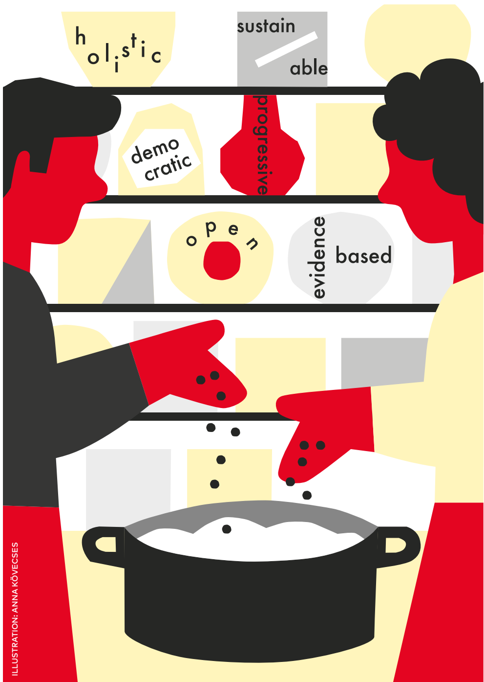
ILLUSTRATION: ANNA KÖVEGSES