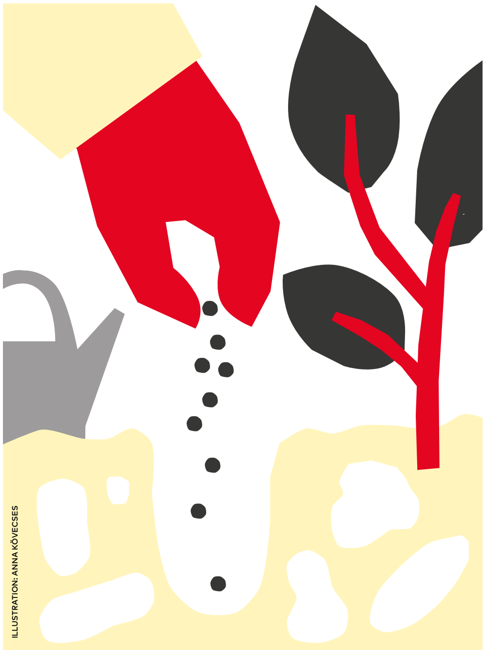
ILLUSTRATION: ANNA KŐVECSES