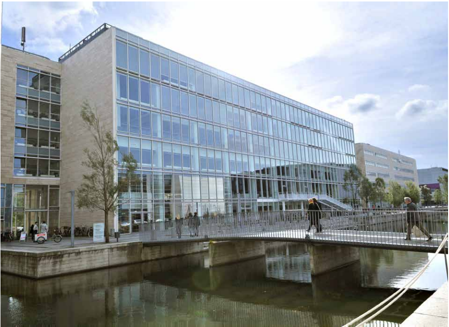
UNIVERSITY OF COPENHAGEN, SOUTH CAMPUS.

Please sign up for one that interests you at the registration desk.