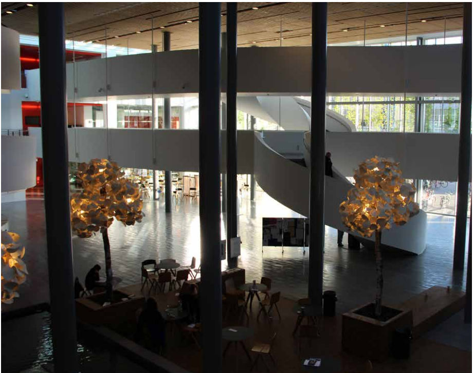
UNIVERSITY OF COPENHAGEN, SOUTH CAMPUS, BIG HALL, KUA2.