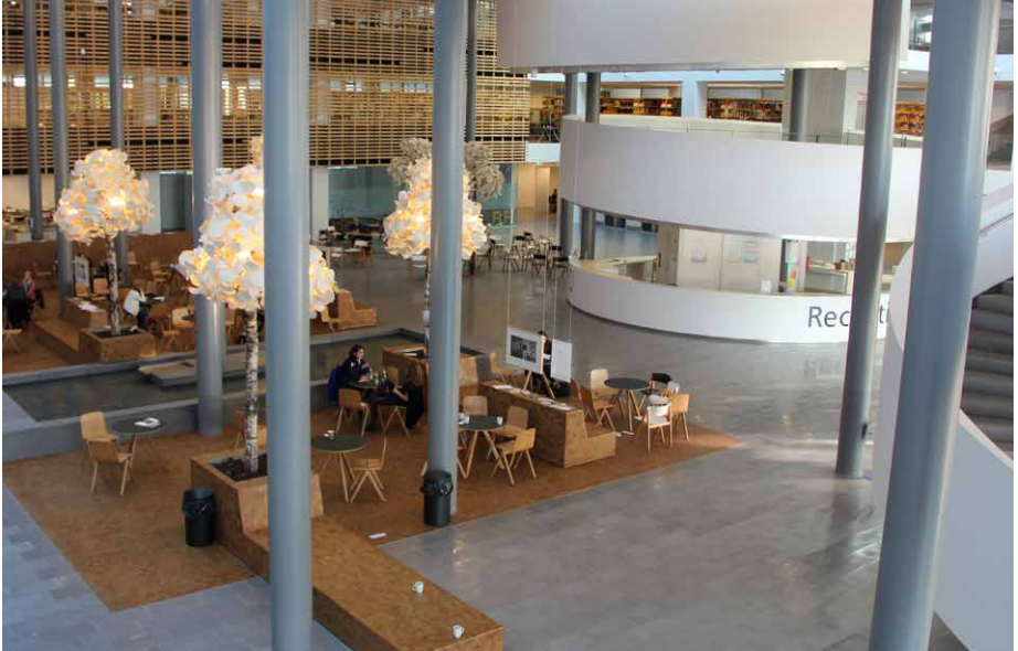
UNIVERSITY OF COPENHAGEN, SOUTH CAMPUS, BIG HALL, KUA2.

Gallery Unión Patriótica. This film is part of a photo-documentary project developed with a group of widows and daughters of assassinated leaders of the Colombian political party Unión Patriótica (UP), a leftist party created in 1986 after a peace agreement between the government and the FARC. It uses historical images from the 1920s, 50s and mainly the 80s.