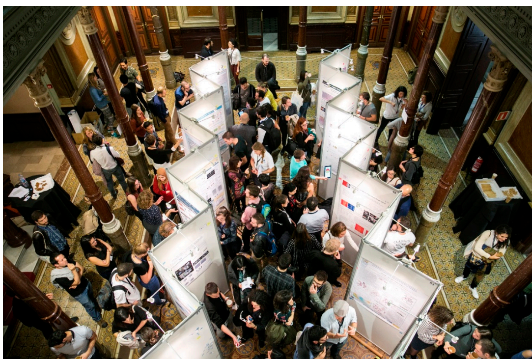
Figure 1. Attendees at ENABLE 2017.

Milan, Radboud Institute for Molecular Life Sciences (RIMLS) in Nijmegen, and Center for Protein Research (CPR) in Copenhagen. In November 2017, the first ENABLE conference took place in Barcelona, Spain. The organization of this conference started almost two years earlier and involved a group of 35 volunteer PhD students and postdocs from the four aforementioned research institutes and the support of institute coordinators and the innovative science communication agency, Scienseed. Like many young scientists nowadays, we felt isolated in our own research areas and wanted to build networks beyond our own fields. This is why we launched ENABLE and what the first ENABLE conference also achieved: it involved young scientists opening the academic world from within and promoted crosstalk between disciplines, collaboration with industry, and communication with society at large. The conference in Barcelona was a huge success, with the participation of 272 young researchers from more than 25 countries within the European Union (EU) and beyond (Figure 1). Companies were also thrilled by our approach, as reflected by our 10 sponsors, who provided more than 60 travel grants, and the more than 20 organizations that were present at our Career Day.