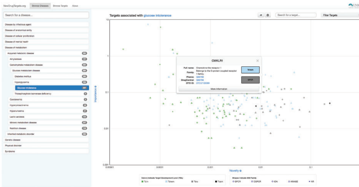
Fig. 1. Screenshot of TIN-X. The disease, glucose intolerance, was queried. Mouse-over displays information about a specific data point, in this case, CMKLR1 (Color version of this figure is available at Bioinformatics online.)

TIN-X provides an interactive visualization, ranking, and prioritization platform for scientists interested in exploring potentially novel drug targets, and examining the relationship between diseases, disease categories, proteins and protein classes, using automated text mining of biomedical literature. As with all current text mining,