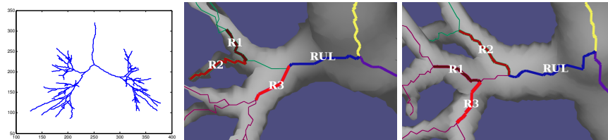
Fig. 1. Left: The method takes only the airway centerline tree as input. Middle-right: Airway trees are frequently topologically different, while geometric differences are small.

Several types of airway branch labeling algorithms have appeared previously. Van Ginneken et al. [11] and Lo et al. [5] use machine learning on branch features, with additional assumptions on airway tree topology. Among the features used are branch length, radius, orientation, cross-sectional shape and bifurcation angle. Branch length and radius are sensitive to the presence of structural noise or diseases like cystic fibrosis, tuberculosis or Chronic Obstructive Pulmonary Disease (COPD), and assumptions on tree topology make these methods vulnerable to topological differences. Tschirren et al. use association graphs [10] for pairs of airway trees, which incorporate information from both trees, such that maximal cliques in the association graph induce branch matchings between the original graphs. This is a combinatorial construction, although it can depend on the geometric properties of the initial trees. Such a separation of geometric and combinatorial properties can be problematic, as airway trees are often geometrically and visually similar despite being combinatorially different, as in Fig. 1. Feragen et al. [2] label airways based on geodesics (shortest paths) in a space of trees. Their tree-space is highly non-linear and has no known efficient algorithm for geodesic computation, making labeling of a complete airway tree infeasible.