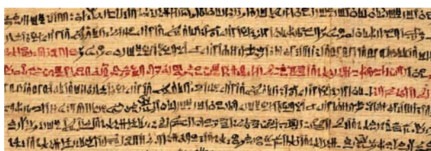
Papyrus Carlsberg 250 (detail), example of hieratic script with a heading in red ink and the main text in black, c. 1000 BC.

Two of the most profound technological advances in human intellectual history were the twin inventions of ink and papyrus by the Egyptians about 5,000 years ago. The advent of writing allowed information to be expanded beyond the mental capacity of any single individual and to be shared across time and space. The two inventions spread throughout the ancient Mediterranean to Greece, Rome and beyond, and they remain a central medium for communication in the modern world.