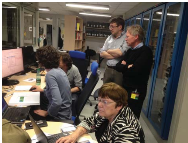
Conducting analyses at ESRF.