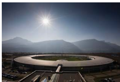
The ESRF - the European Synchrotron Radiation Facility located in Grenoble - is one of the world's most intense X-ray sources and a centre of excellence for fundamental and innovation-driven research in condensed and living matter science.

CoNeXT is a University of Copenhagen interfaculty collaborative project, supported for the period 2013-2016 by University of Copenhagen Programme of Excellence (UCPH 2016). It is initiated by the new neutron and X-ray synchrotron research infrastructures that operational or under construction in Lund, Sweden and Hamburg, Germany: ESS, MAX IV, Petra III and European XFEL. The aim of the project is to ensure that UCPH will be ready to use the full potential of the new neutron and X-ray sources and can act as a portal for Danish and North European Industries with potential for use of the unique research infrastructures. It unites scientists that are experienced users of the large facilities with other that can see the great potential in the facilities. At present CoNeXT involves 31 researchers from 5 faculties (HEALTH, HUM, LAW, SOC and SCIENCE) that all are engaged in interfaculty collaborative projects directed towards the large facilities. Web page: conext.ku.dk .