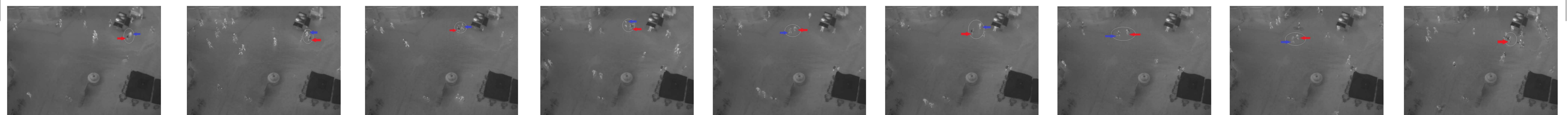
1. The facer is talking to a person 2. End of conversation and split up 3. Approaches person successfully 4. End of conversation and split up 5. Approach unsuccessful 6. Tries new approach but unlucky 7. Tries new approach again 8. Approach unsuccessful 9. Decides to take a break